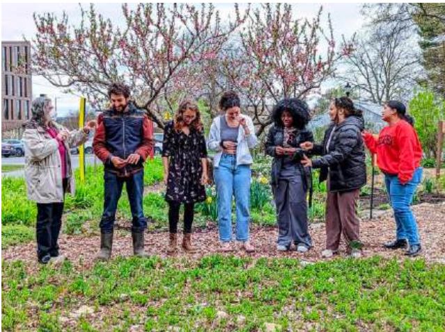
Participants from the Women of Color Leadership Network on a tour of the garden