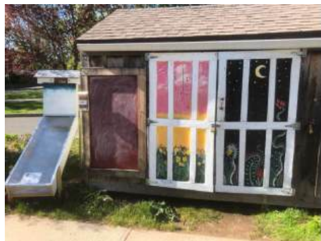
Shed mural and new solar dehydrator

Our food was utilized throughout UMass Dining and the greater community. The lion's share, 530 lbs., was sold through the farmers' market where we offer students our fresh and value-added products at reasonable prices. The new restaurant in Worcester DC, Commonwealth kitchen, received 120 lbs. of high-value baby greens and microgreens. We also donated 150 lbs. to the Amherst Survival Center.