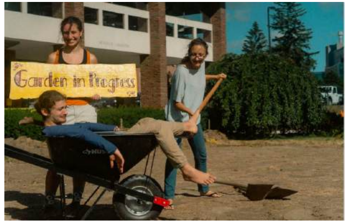
Summer gardeners working on the new “Franklin East” Garden

One of our proudest achievements of 2022 was officially breaking ground on the expansion of the Franklin Garden, colloquially called the “Frank East Garden”. Beginning in August 2022, we began turning an underutilized lawn into a handicap-accessible raised bed garden that will significantly expand our capacity to educate and grow food for the community.