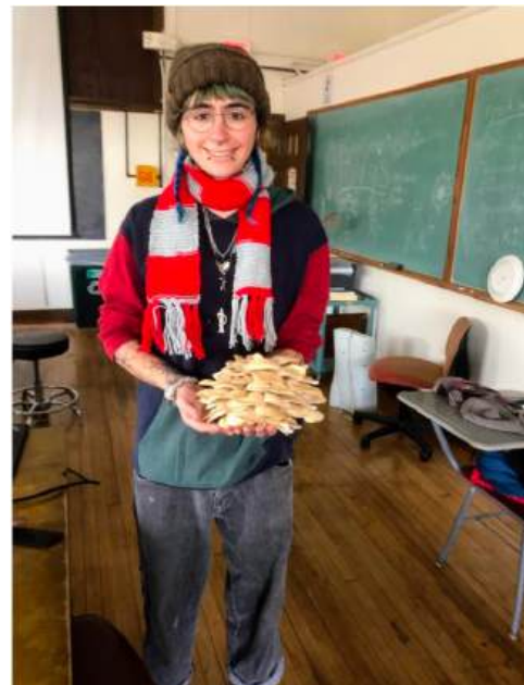
A practicum student holding some oyster mushrooms grown on cardboard and coffee