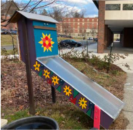
Our new solar dehydrator, built in collaboration with the Makerspace and an environmental conservation class

We offered 18 class and community tours of our gardens with a total of 240 participants .