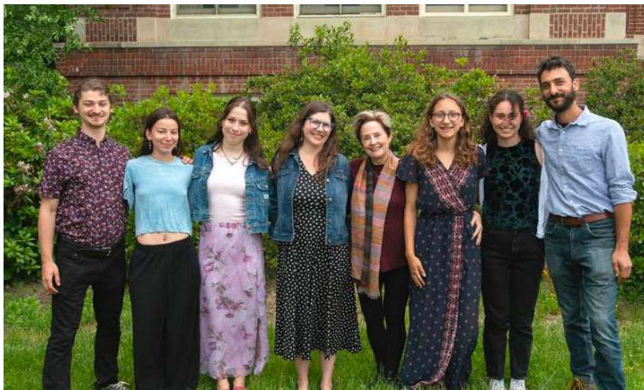
Alice Waters with UMass Permaculture Summer Gardeners during the Chef's Conference

We're proud that our gardens also continue to be living classrooms for other campus classes and organizations. A class taught by Environmental Conservation Professor Charles Schweik built and installed a solar dehydrator, allowing us to increase our food preservation work. Currently, we are in conversation with an engineering team to build and site a biodigester in our garden, which would allow us to demonstrate this powerful green technology.