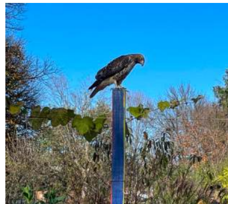
A Red-Tailed hawk perched on our grape trellis

With great appreciation and love, The UMass Permaculture Team