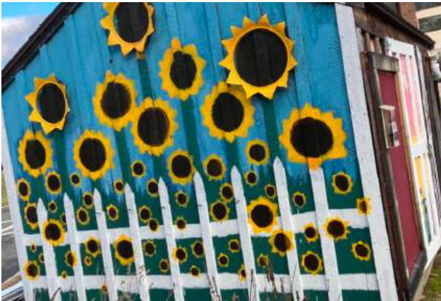
New mural painted by a student in the practicum course

- Anonymous, found in the Garden Journal