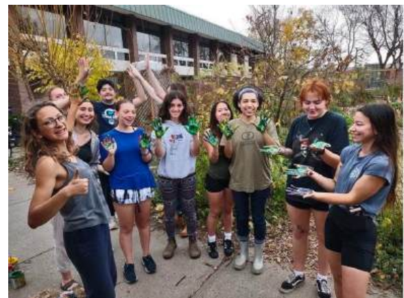
Volunteers celebrate a great season with some hand stamps

We recognize the need to widen our doors and strengthen our mycelial web so that the entire campus ecosystem benefits from our work. With that in mind, we're also busy cultivating additional community partners who want to access our living laboratory of sustainability, regeneration, and resilience. We hope you'll come by for a visit, reach out with your ideas, and continue to support our growth.