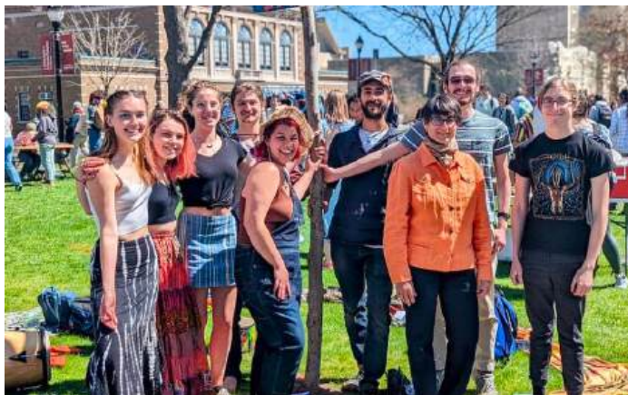
Organizers and participants at the 2022 Earth Day Extravaganza

That energy continued right into our Fall market season. We had 83 different student vendors, organizations, and student groups table during our 8-week Fall season. That diversity led to our strongest attendance ever, with most markets seeing at least 300 visitors. Several local publications including the Daily Collegian and Amherst Wire took note of this interest and featured the market with headlines such as " UMass Student Farmer's Market Emphasizes Community and Sustainability ".