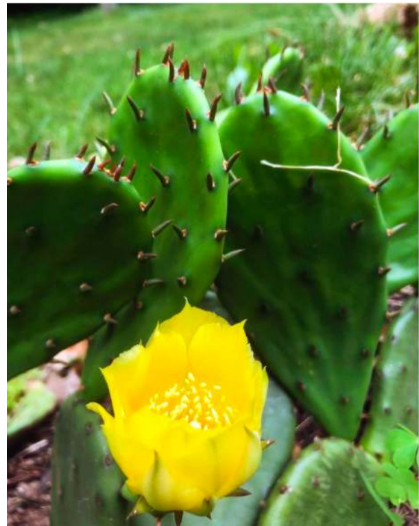
Prickly Pear Cactus in bloom