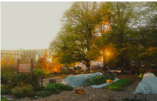
Sunset in the Franklin Garden